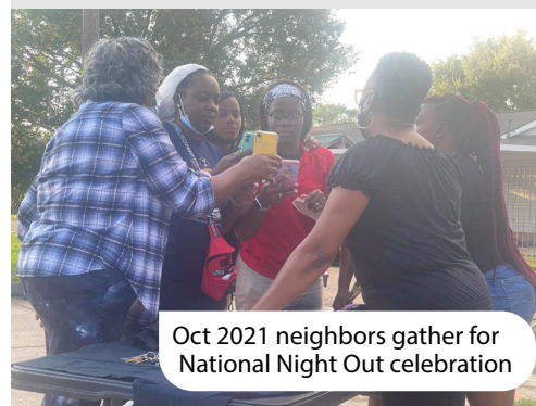
Oct 2021 neighbors gather for National Night Out celebration

Allendale Strong will continue collaborating with the CR Institute Agile Community Initiative to grow Allendale citizen relational capacities to envision a future that they lovingly bring to life through guided learning-doing groups. Among current preformation topics: platform cooperatives, incremental development, land trusts, citizen generated and guided neighborhood plan (plan driven, not project driven), gentrification with justice, citizen led street design team to guide urban street design for local wealth building, distributed power generation proposal, and a Community Vision book club to learn as a group what a vibrant community looks like, and how to make it happen in Allendale.